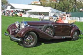
1939 Mercedes-Benz 540K