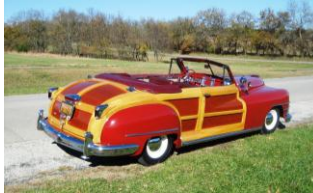
1946 Chrysler Town & Country