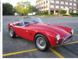
1964 AC Cobra