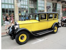
1928 Packard 526