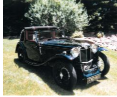
1939 MG TA Tickford