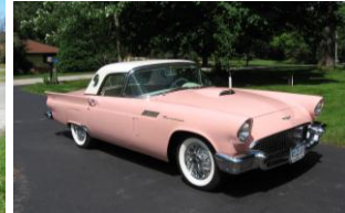
1957 Ford Thunderbird

The focus of the Concours is on fine vintage motor vehicles driven during the Carl and Edith Weeks family era of the Salisbury House (1923-1953), when they built and lived in the mansion. The Concours includes vintage vehicles prior to 1923, collectible vehicles up to 1960, and special feature classes that may reflect any period of interest.