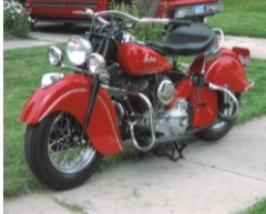
1947 Indian Chief