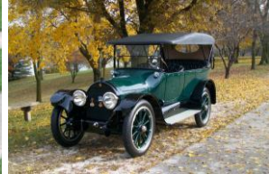
1916 Cadillac 7 Touring