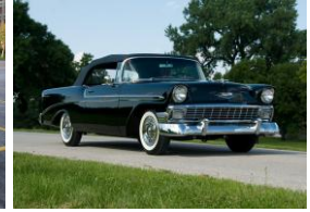
1956 Chevrolet Bel Air